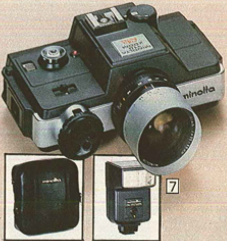
With SLR viewer, zoom lens, case, auto-flash

(7) Minolta 110 Zoom SLR LENS, SHUTTER, FOCUS: See Chart below, right. Macro setting for as close as 11.5 in. View, shoot thru same lens. Low light, B. X, shutter speeds, battery indicator in viewfinder. Microprism focus. EXPOSURE CONTROL: You set aperture; shutter speed sets automatically. ± 2 E.V. override manual shutter adjustment. Accepts ASA 400 film. FLASH: Auto Electroflash 25 detachable; clip-on to hot shoe. Use 4 AA batteries, p. 32. Recycles in 7 sec. CONSTR: Black plastic, metal. 5.3x4.3x2.1 in. Tripod socket, cord lug, hot shoe, lens hood. Case, strap, imported. ORDER INFO: Warranted by Minolta. Write for free copy, see page 33. Shipping weight 2 lbs. C3 HA 78202C $209.50