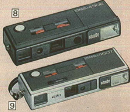
With built-in auto flash

(7) Minolta 110 Zoom SLR LENS, SHUTTER, FOCUS: See Chart below, right. Macro setting for as close as 11.5 in. View, shoot thru same lens. Low light, B. X, shutter speeds, battery indicator in viewfinder. Microprism focus. EXPOSURE CONTROL: You set aperture; shutter speed sets automatically. ± 2 E.V. override manual shutter adjustment. Accepts ASA 400 film. FLASH: Auto Electroflash 25 detachable; clip-on to hot shoe. Use 4 AA batteries, p. 32. Recycles in 7 sec. CONSTR: Black plastic, metal. 5.3x4.3x2.1 in. Tripod socket, cord lug, hot shoe, lens hood. Case, strap, imported. ORDER INFO: Warranted by Minolta. Write for free copy, see page 33. Shipping weight 2 lbs. C3 HA 78202C $209.50