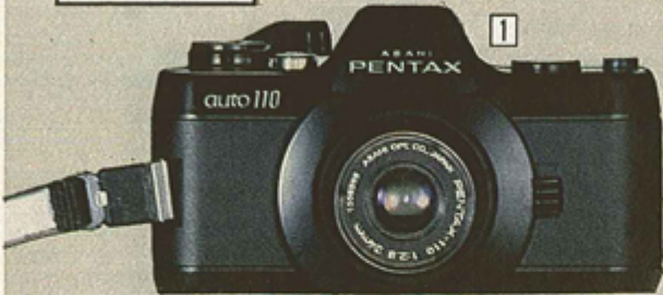
New at Sears... one of the smallest, most versatile 110 SLR's

(1) Pentax Auto-110 SLR LENS, SHUTTER, FOCUS: See Chart bottom, right. Electronic behind-the-lens shutter. Comes with standard lens; wide-angle, telephoto sold at right. EXP. CONTROL: Programmed automatic exposure system. Daylight or flash. Accepts ASA 400 film. CONSTRUCTION: Black plastic and metal. 2.2x3.9x1.8 in. Tripod and cable release sockets, synchronizing terminal for auto flash. Battery holder tray, winder capability. Interchangeable bayonet mount lens. Back-cover window for exposure count. Actual wt. 6.1 oz. Imported. ACCESSORIES: Case, wrist strap, battery. ORDERING INFO: Warranted by Pentax. Write for free copy, see page 33. C3 HA 78101C —Shipping weight 1 lb. $179.50