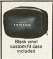
Black vinyl custom-fit case included